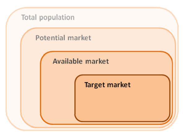
Figure 2: Selecting the target market